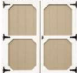
6' or 7' Double Door