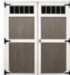
6' or 7' Double Transom Door