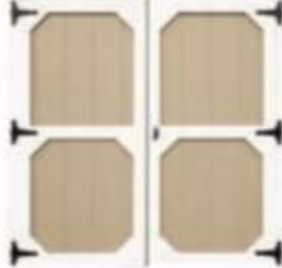
6' or 7' Double Door