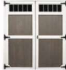
6' or 7' Double Transom Door